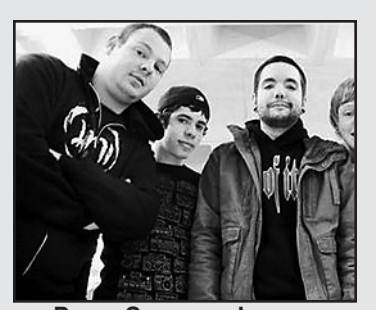
Bad Religion House of Blues Anaheim 3/18/10