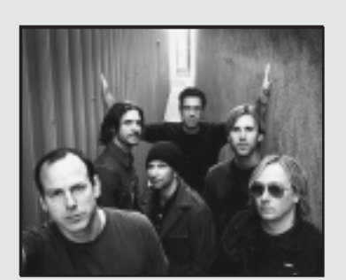
Sick Puppies Galaxy Theatre Santa Ana 3/19/10 Price: TBA

A Day to Remember The Wiltern Los Angeles 4/30/10 $22.50